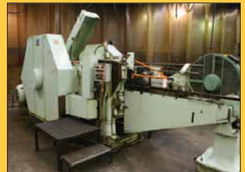
1/2" WATERBURY #33 DSOD