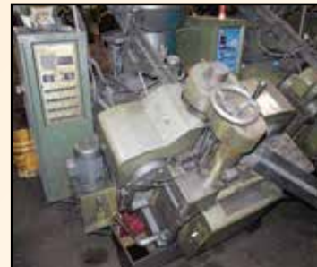
HIGH SPEED POINT FORMERS