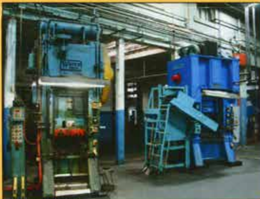
VIEW OF PRESSES

National Roller Headers, Progressive & Parts Former from 1/8"-1", RMG Wire Drawing Equipment, Lewis Wire Straighteners, Baird #3 - #5 Bushing Machines, Kingsbury Rotary Transfers, Benex Rod Straightener, Complete Machine Shop, Tsugami CNC Turning Equipment, Blanchard Grinders, Complete Chain Lines from 1" Pitch to 2" Pitch, Wheelabrator, Several Complete Furnace Lines, Press Department Consisting of Minster and Niagara 60 Ton to 300 Ton with Uncoilers, Multi-Slide and Nut Forming Department, Bolt Makers, Cranes and Much, Much More!