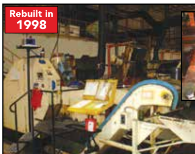
1/2" NATIONAL 89, 2 DIE 3 BLOW