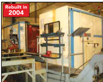
5/8" NATIONAL FORMAX 54-L, 4 DIE 4 BLOW LONG STROKE COLD FORMER

FEATURING: Well Maintained National Cold Parts Formers up to 1", Formax Long Stroke Multi-Die, Many 2 Die 3 Blow Headers, Medium and Long Stroke Single Die Cold Headers, High Speed Thread Rollers, some with Washer Assembly Systems, Bolt Trim Presses, In-Line Wire Drawers, Automated Late Mdl. Fastener Washing System, Air Cleaning Systems and Much Much More!