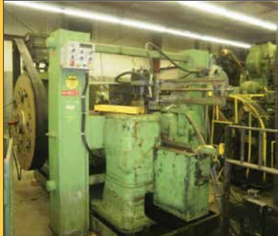
5/8" WATERBURY #44 HAND FEED DSOD ROD HEADER