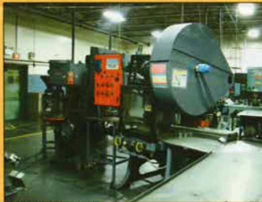
CHAIN ASSEMBLY LINE