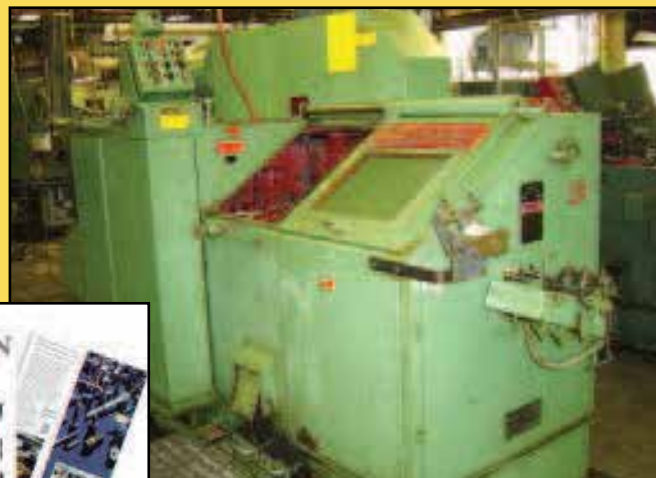
National 34 203B