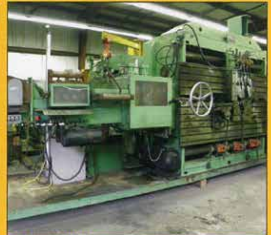
5/8" REFFLINGHAUS MDL SBP