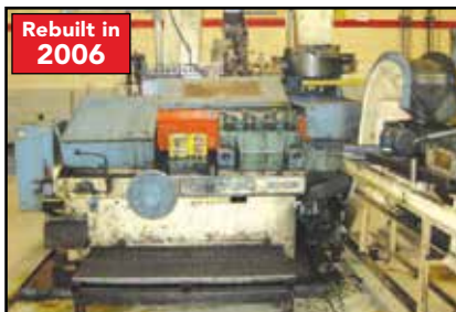
5/8" HARTFORD 30/40-180

TRIM CAPABILITY FOR HEX AND 12 PT. BOLTS