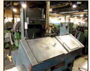
NATIONAL THREAD ROLLERS