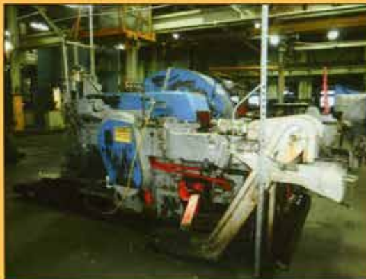
NATIONAL 1/2" PROGRESSIVE COLD FORMER