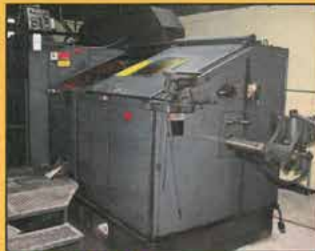
56-S1 NATIONAL 2 DIE 3 BLOW