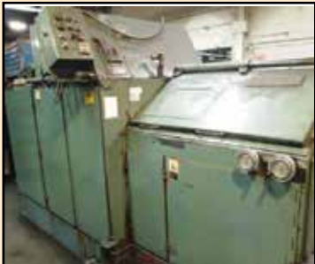
NATIONAL HS HEADERS