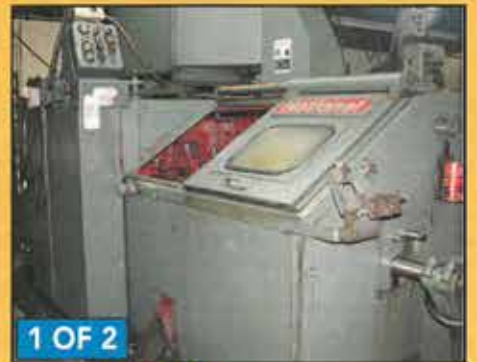
34 NATIONAL 2 DIE 3 BLOW