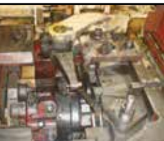
1/2" NATIONAL 810, LONG STROKE