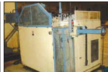
5/8" RMG 1011-40106-70 W/PRE FEED AND STRAIGHTENER