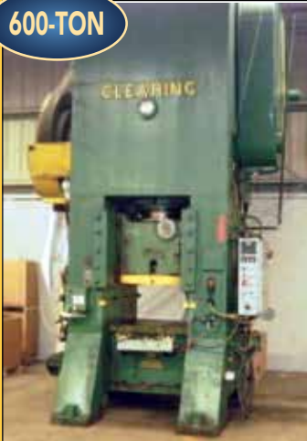
CLEARING STRAIGHT SIDE PRESS