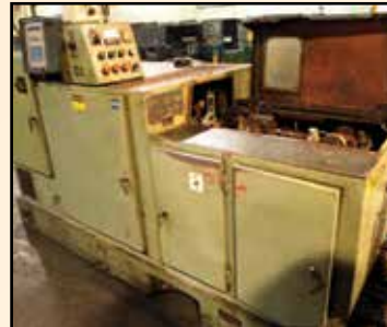
NAKASHIMADA 2 DIE 3 BLOWS