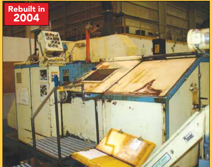
3/8" NATIONAL 56-S1, 2 DIE 3 BLOW COLD HEADER