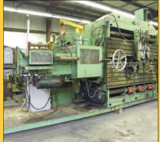
5/8" REFFLINGHAUS MDL. SBP