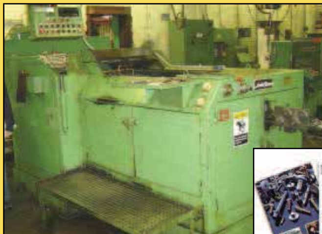
Asahi Okuma 8XL 2D2B