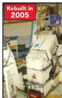
1/2" EW MENN AF-10