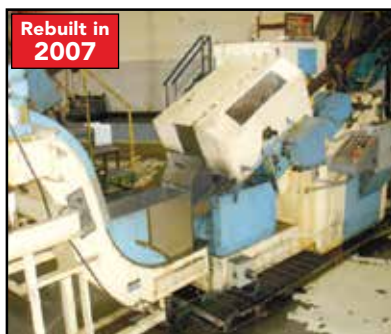
1/2" SASPI GV-3-20