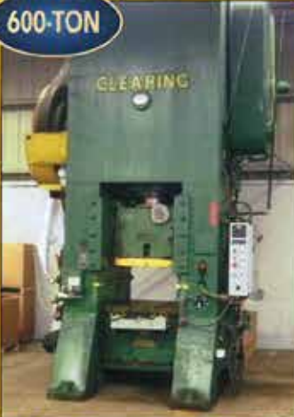
CLEARING STRAIGHT SIDE PRESS

WORLD RENOWNED MANUFACTURER OF AUTOMOTIVE MUFFLER HANGERS, SEAT RODS, DOOR STRIKERS, HEAD RESTS AND OTHER LONG HEADED RODS AND BENT WIRE FORMS