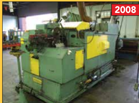
ASAHI-OKUMA 2 DIE 3 BLOW COLD HEADER