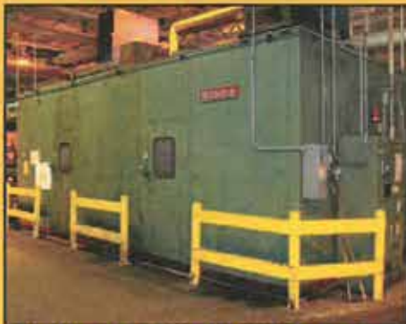
1" NATIONAL 5 DIE 6 STATION COLD FORMER, YEAR 1982

All Well Maintained, American Made Machinery, Still Under Power!