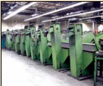
WARREN BULK LOADERS