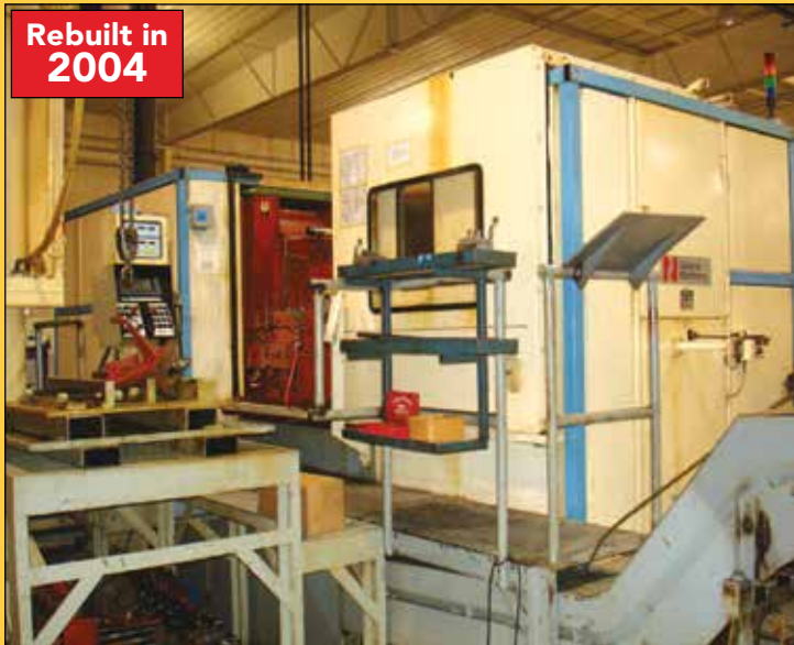
5/8" NATIONAL FORMAX 54-L, 4 DIE 4 BLOW LONG STROKE COLD FORMER

FEATURING: Well Maintained National Cold Parts Formers up to 1", Formax Long Stroke Multi-Die, Boltmakers, Many 2 Die 3 Blow Headers, Medium and Long Stroke Single Die Cold Headers, High Speed Thread Rollers, some with Washer Assembly Systems, Bolt Trim Presses, In-Line Wire Drawers, Automated Late Mdl. Fastener Washing System, Air Cleaning Systems and Much More!