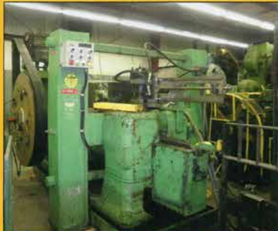
5/8" WATERBURY 144 HAND FEED DSOD ROD HEADER