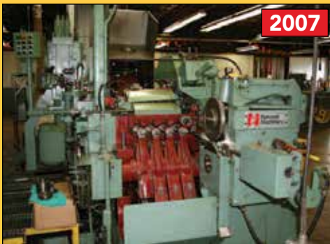
NATIONAL S-3 4 DIE BOLT MAKER