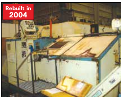
3/8" NATIONAL 56-S1, 2 DIE 3 BLOW COLD HEADER