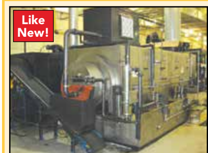
MIDBROOK/HURRICANE TUMBLE BARREL TYPE PARTS WASHING SYSTEM